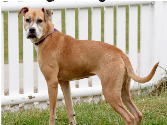
Age: 7 years Sex: Spayed Female Breed: Boxer mix

Jilly is 7 years old and came to CVHS because her family did not have enough time or space for her. This sweet girl is looking for a medium energy home where she can be queen of the castle. She would do best as the only pet in a home with kids 8/10 or older. She is looking for a family that will help her with her leash manners and basic obedience. She has been on a hypoallergenic diet at the shelter and will need to stay on one in her new home. Jilly is ready to enjoy her golden years - will you be her best friend?