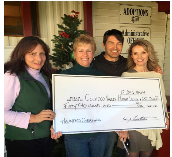
Haunted Overload generously donated their $50,000 winnings to Cocheco Valley Humane Society

We are so grateful for Haunted Overload's continued friendship and support. And we are honored to partner with them each year to help present one of the greatest Halloween attractions in the country. Congratulations, Haunted Overload, for a tremendous year and thank you for all you do for CVHS!